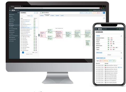
Zixi's ZEN Master UI

Zixi's ZEN Master enables advanced monitoring and administration of markers such as SCTE-35 that are crucial to SSAI with DAIConnect<sup>®</sup>.