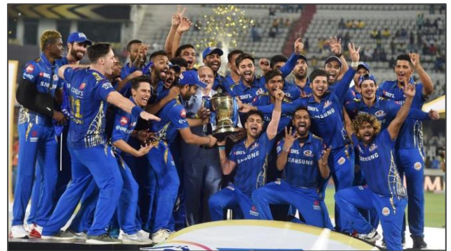
Zixi Provided Low Latency Delivery of the IPL Final in 2019.

Zixi transcoding and HLS packaging supports CMAF and the community recommended chunked-based-encoding-and-transfer-approach supported by CDNs and video players. Using this approach, sub-three second delivery latency is achievable.